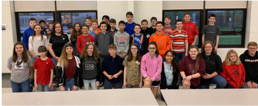
Students that have participated in the “Walmart Bike Club” and STEM Bicycle Club in the 2018-2019 school year. Each quarter students can apply for a different club; many apply to stay in the same club.

Through the “Walmart Bike Club” the word “service” goes beyond repairing bikes and into the “action of helping or doing work for someone”. The fixed Walmart bikes are donated into the community.