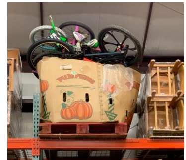
Shipment of Walmart bikes stored in the Ockerman Middle warehouse.

Through the “Walmart Bike Club”, Walmart Supercenter in Florence, Kentucky sends bikes that are damaged and cannot be sold to the warehouse at Ockerman Middle School. There, the Ockerman warehouse staff store and organize the bikes that the club uses.