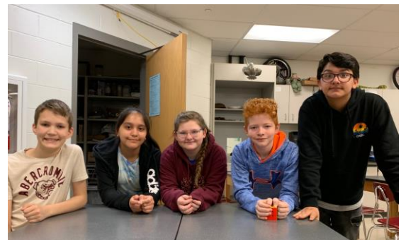
Interviewed Ockerman students. “What was the hardest thing you had to fix this year?” “We had a bent gear shifter that had to be fixed and realigned.”

When asked what their favorite part of STEM Bicycle/” Walmart Bike Club” was, students explained it was the service piece of the club – that the bikes are donated to children who don’t have their own and could use them. They also said riding the bike when no one is looking is the next best part.